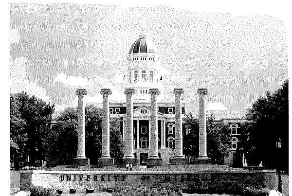
University of Missouri-Columbia

Free workshops, Free Brokerage Accounts, and Free Study Abroad provide recipients with a practical understanding of important life skills not typically covered in the school curriculum. Hagan Scholars have attended 482 colleges and universities located in 48 states.