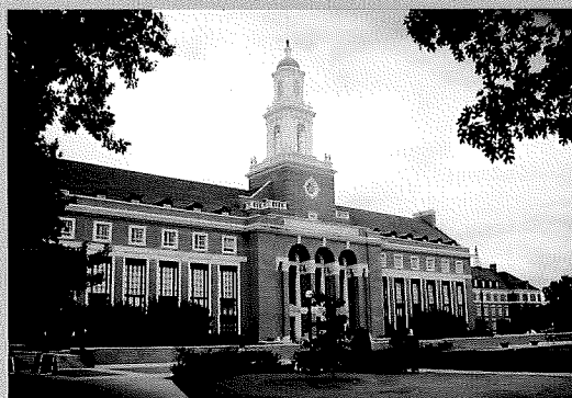
Oklahoma State University

“Hagan Scholar Testimonials” can be found on the HSF website, under the Scholarship Information Link.